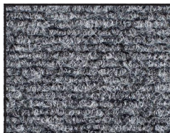
#27 DARK GREY