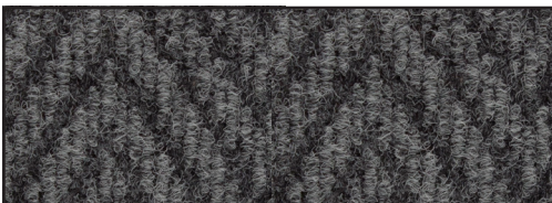
#27 DARK GREY