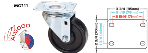
Plate size: 2 3/4" x 3 3/4" Bolt holes: 1 3/4" x 2 13/16" Bolt hole size: 5/16"